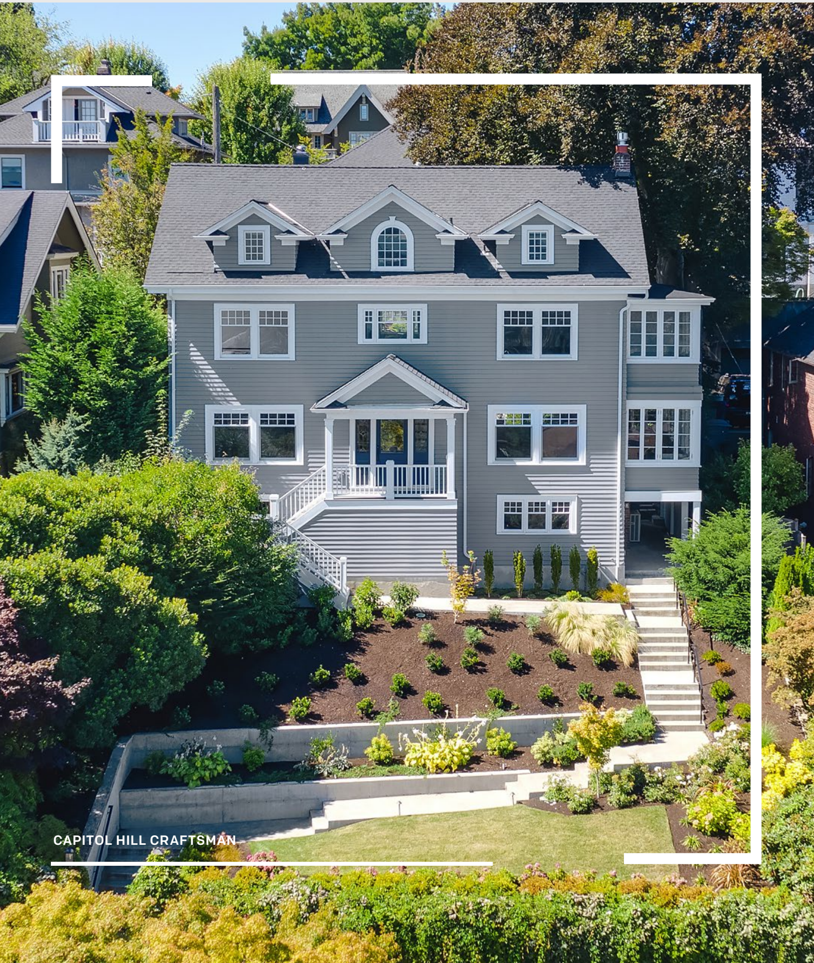
CAPITOL HILL CRAFTSMAN